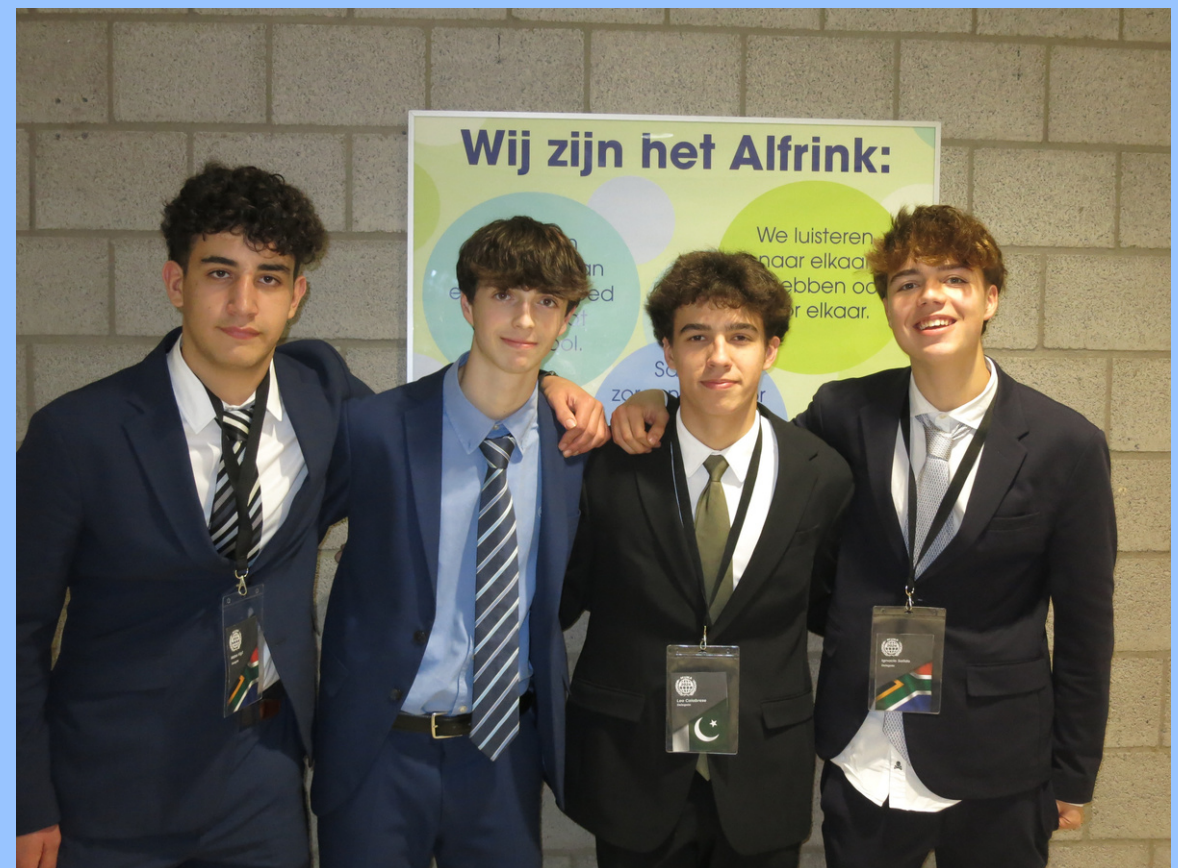
Most likely to get lit at the MUNA party