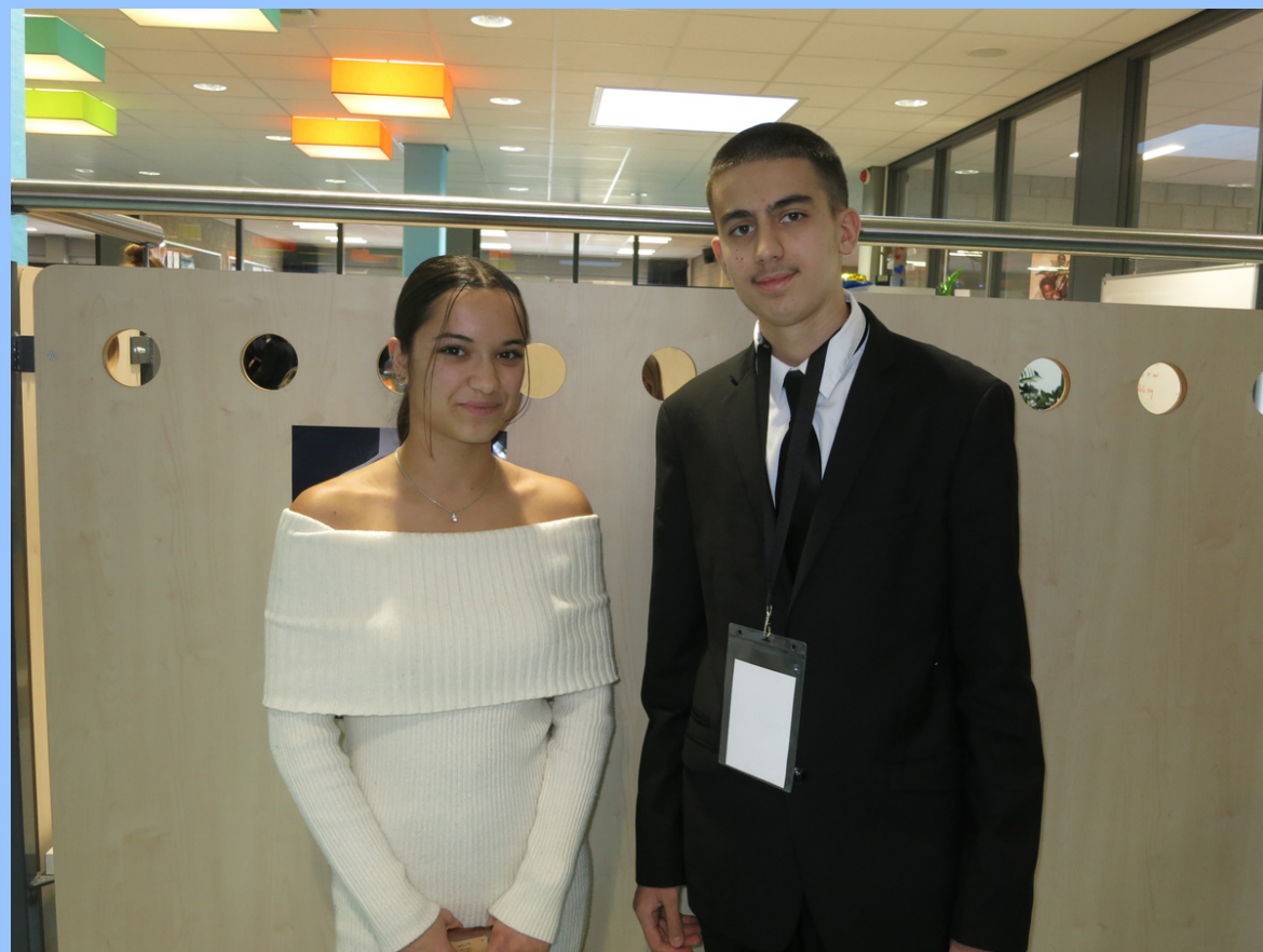
Cutest couple that never was