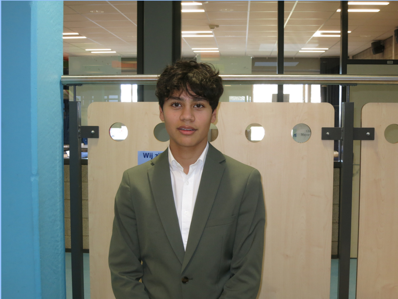
Best looking male delegate