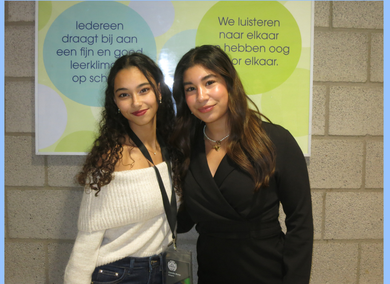
Best looking female delegates