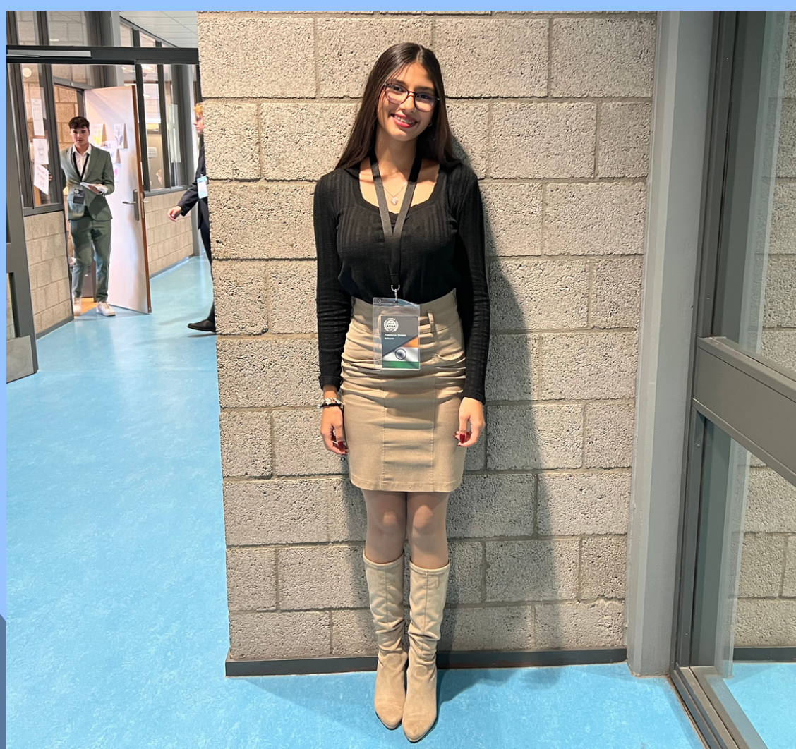
Best dressed day 2