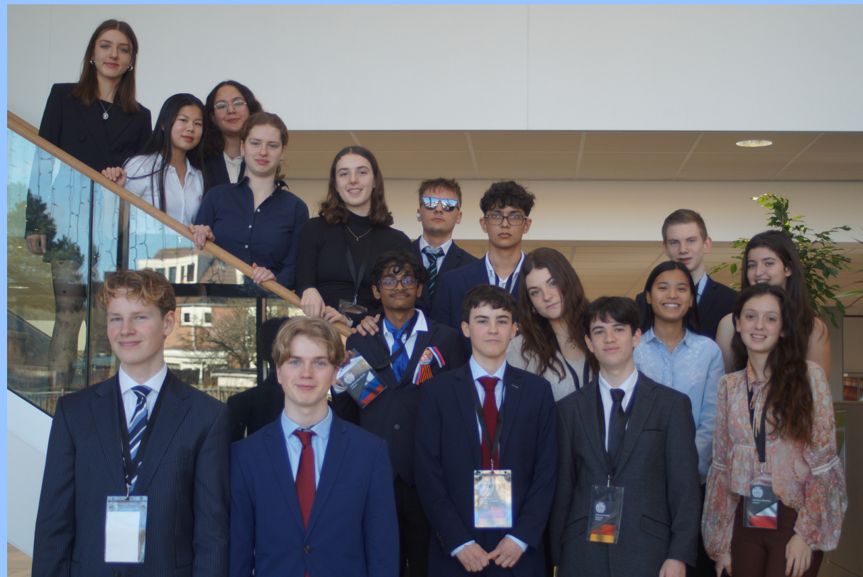
Best committee: ICJ