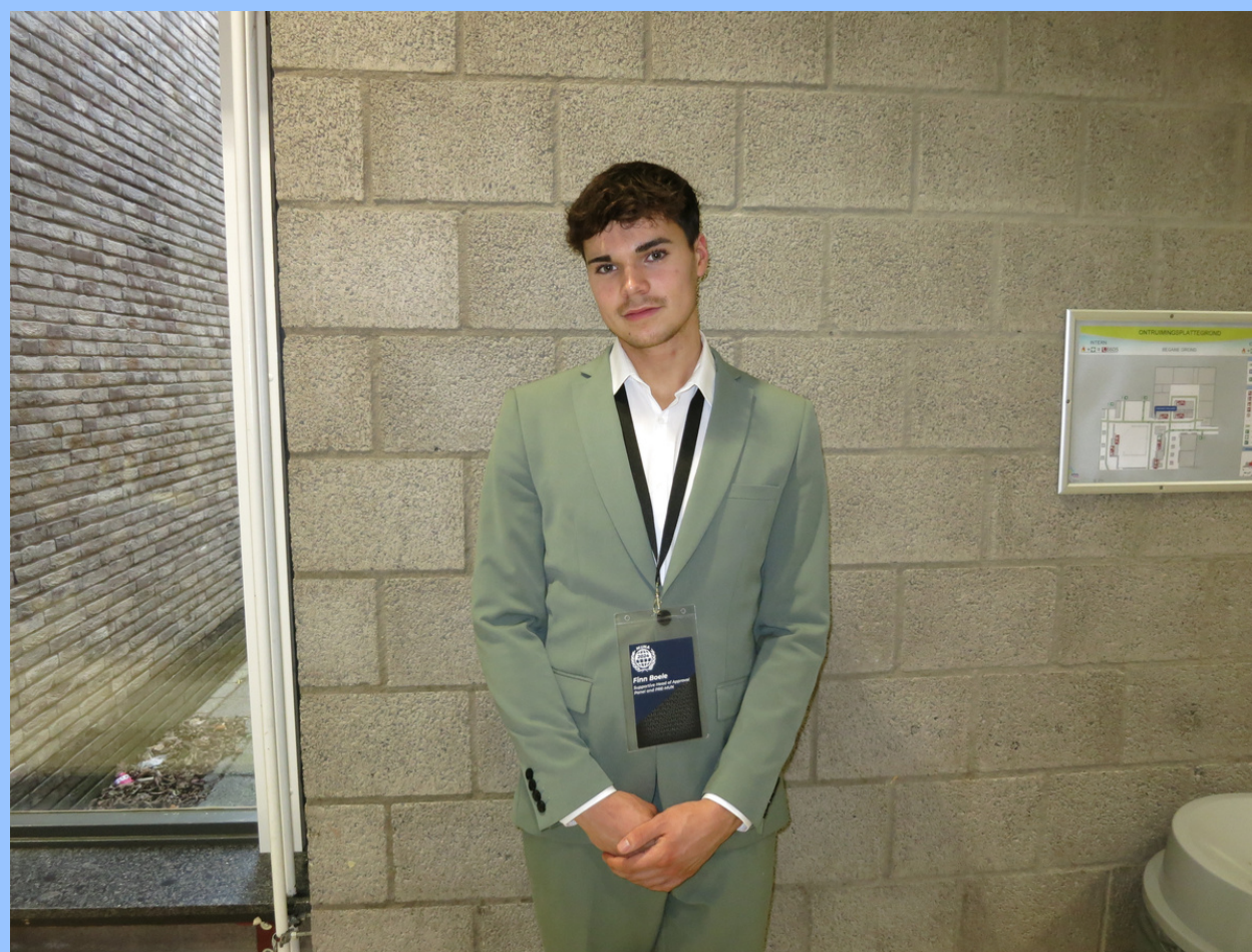
Best dressed day 3