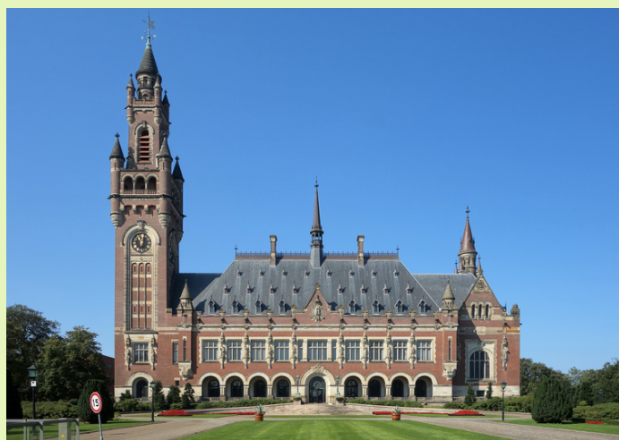
the Peace Palace

I hope you will enjoy this year's excursions to the fullest!