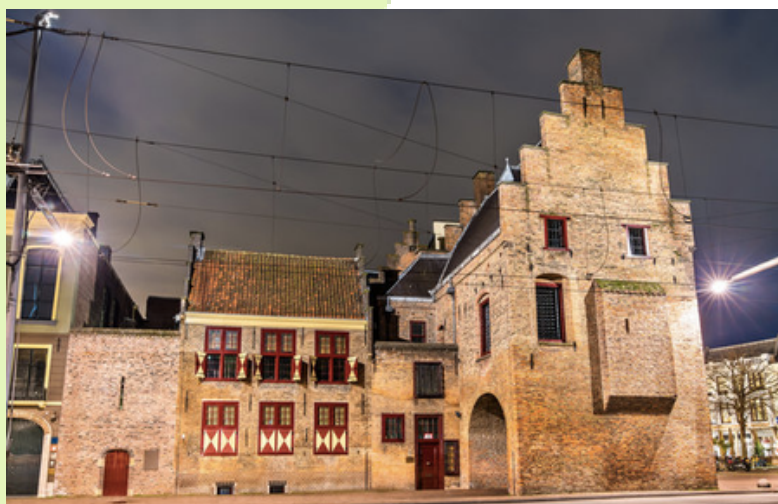
the Prison Gate Museum

The Peace Palace in The Hague houses the Permanent Court of Arbitration, the United Nations International Court of Justice and the Hague Academy of International Law. These institutions are supported by the Peace Palace Library, one of the most prestigious libraries in its field.