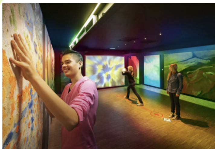
the Chambers of Wonder