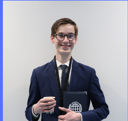
Most likely to become president