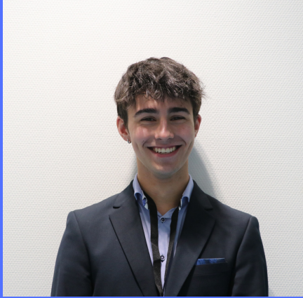
Most outgoing delegate