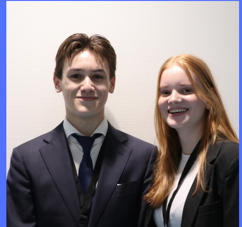
Best couple that never was